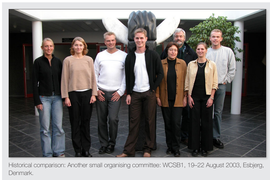
Historical comparison: Another small organising committee: WCSB1, 19–22 August 2003, Esbjerg, Denmark.